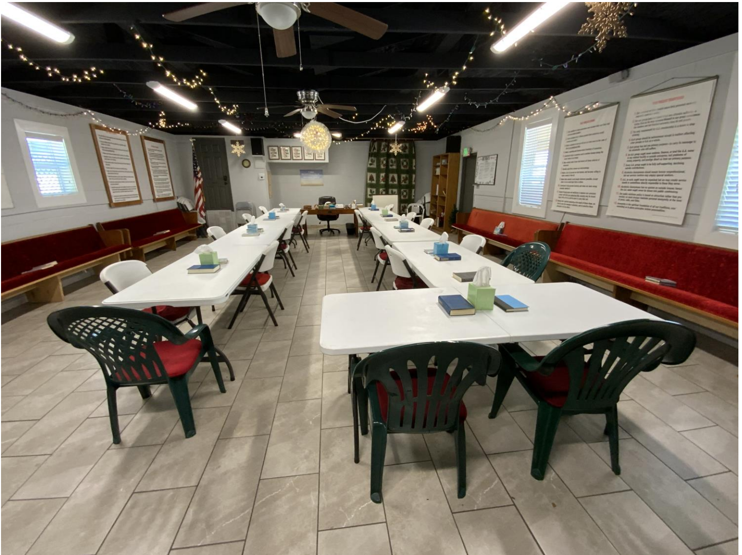
The Rockport Fellowship Group meets at the Rockport Friends Club House (814 Wharf Street in Rockport).

“When anyone, anywhere, reaches out for help, I want the hand of AA always to be there. And for that I am responsible.”