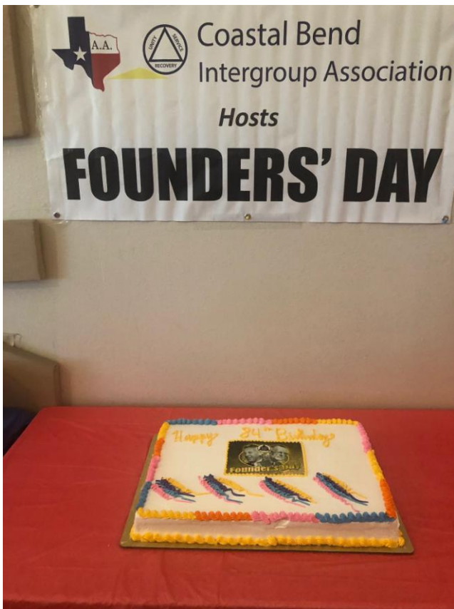
2019 Founders' Day Banner and Cake.