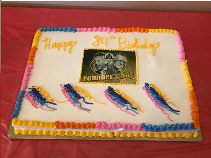
Founder's Day Cake - Celebrating AA's 84 th Birthday