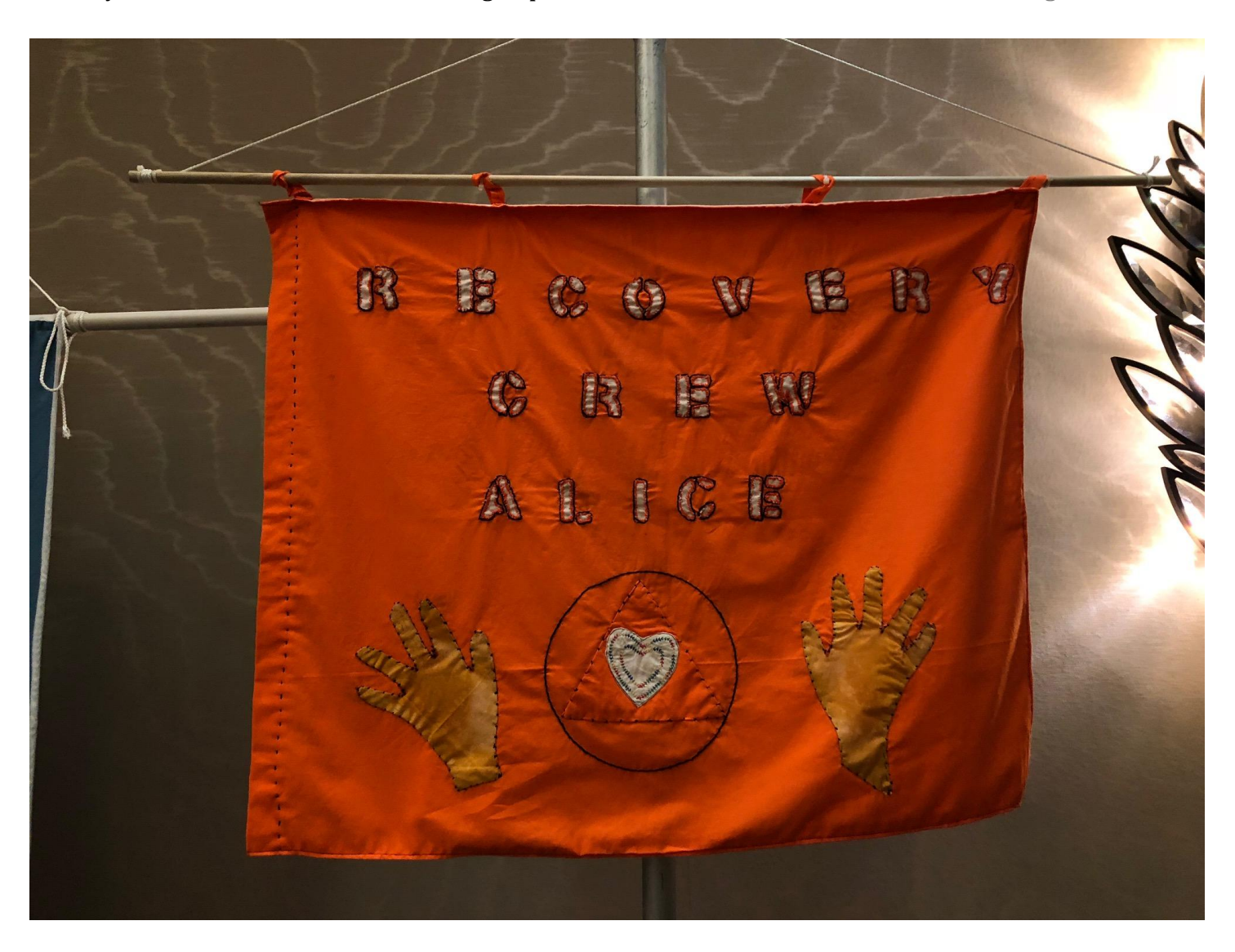
The Alice Recovery Crew Group meets at the Episcopal Church of the Advent (200 N. Wright Street in Alice). They have meetings at 7:00 PM on Mondays, Tuesdays, Wednesdays, and Thursdays. They recently joined District 8E.